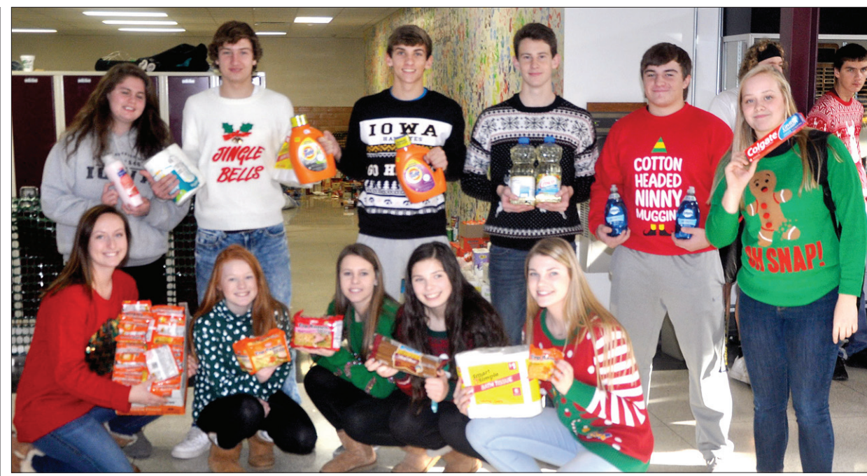
Spartans Blocking Hunger a big success- Students at Grundy Center High School capped a season of giving with a holiday celebration on Thursday, and a group of them posed for a photo to show off all of the items donated as part of the "Spartans Blocking Hunger" initiative. This is the second year of the program.